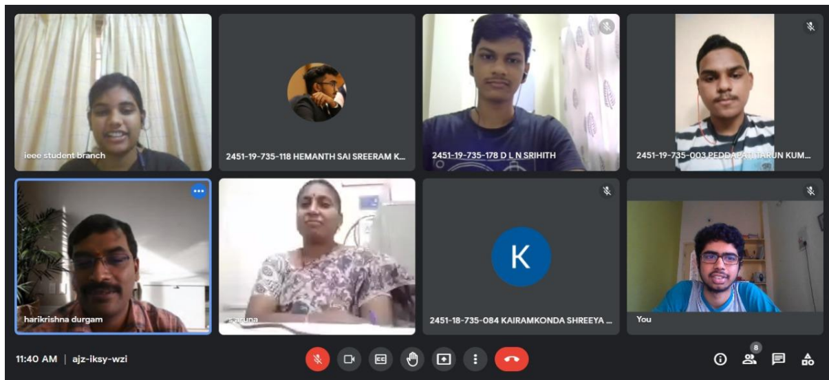
Attendees of IEEE MVSR CASS GBM